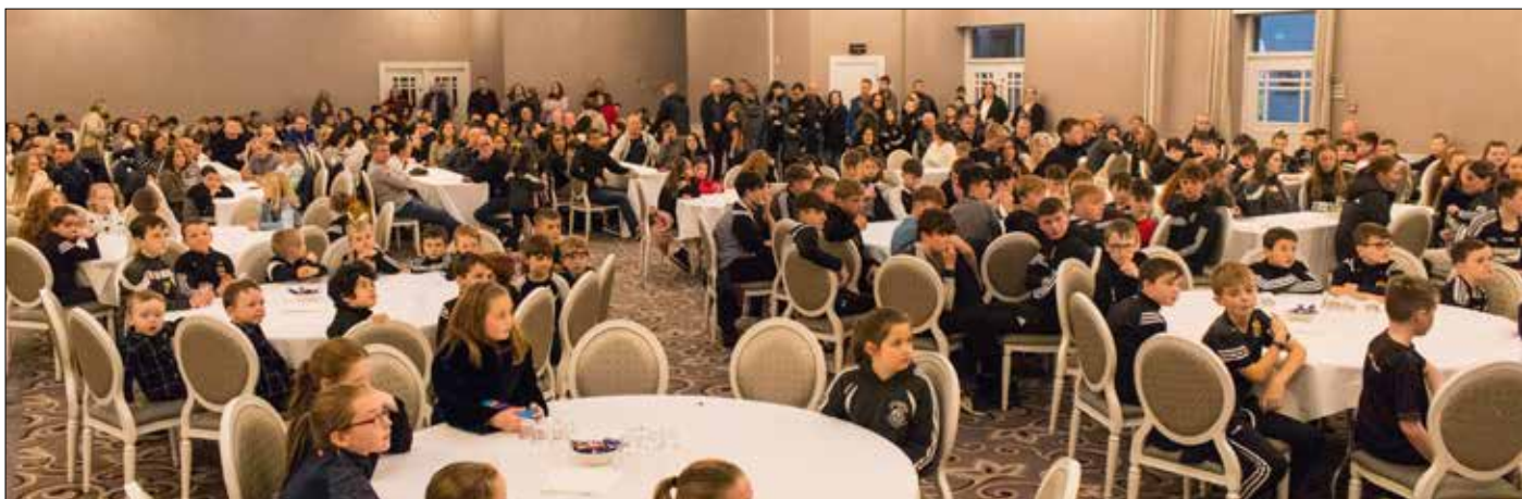
A section of the huge crowd in attendance