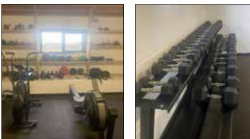
New gym equipment