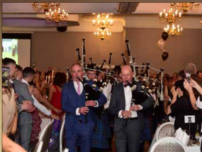
The evening started with the Clew Bay Pipe Band leading the All-Ireland winning men's Senior team in to the room