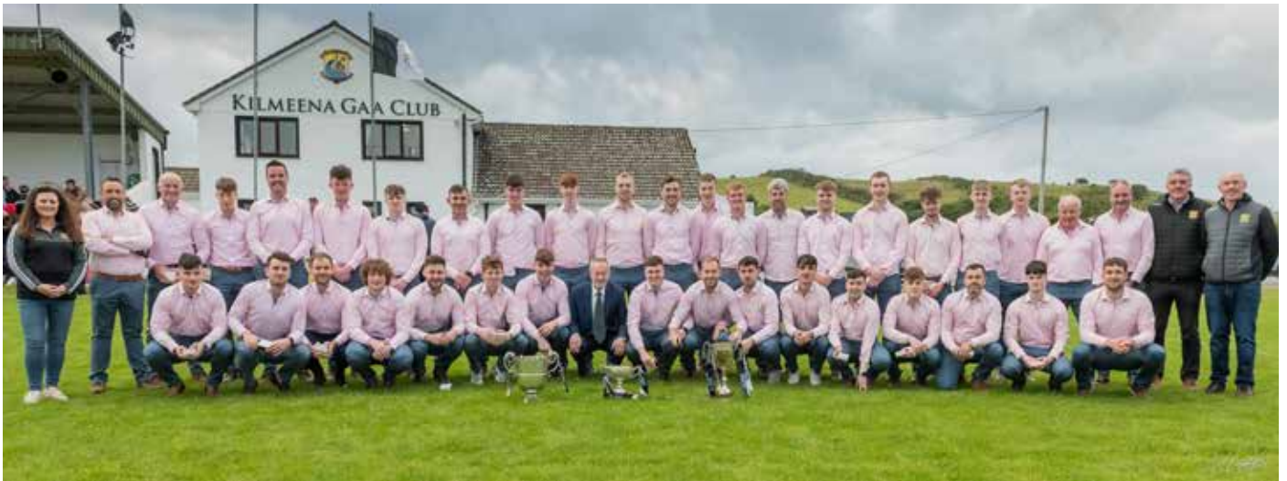
Members of the Junior All-Ireland team pictured with Sean Kelly MEP and former President of the GAA (2003-2006) following their All-Ireland medal presentation.