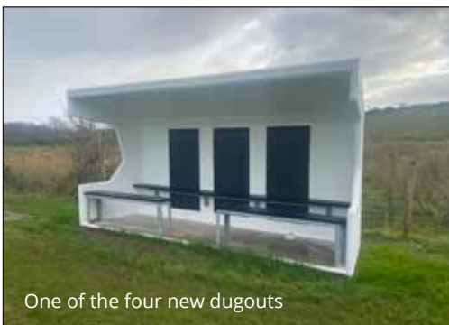
One of the four new dugouts