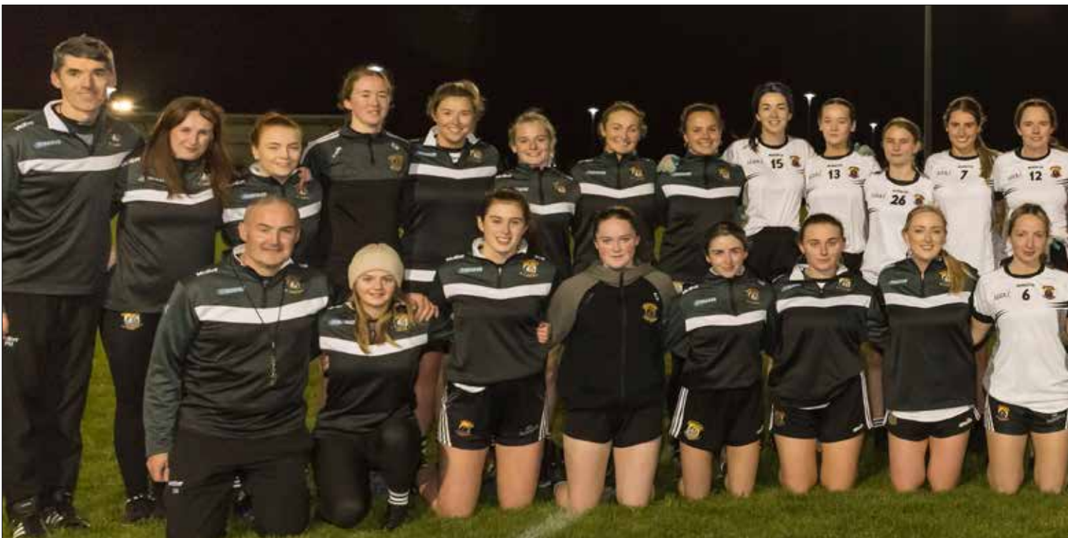
Kilmeena Junior Ladies

As we progress now to Junior A and aspire to continue to build momentum and strengthen the club, we would like to acknowledge and thank those who have been influential in the success we have found to date; to all our supporters who have travelled