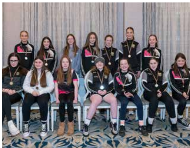
U13 Girls County League Shield Runners Up