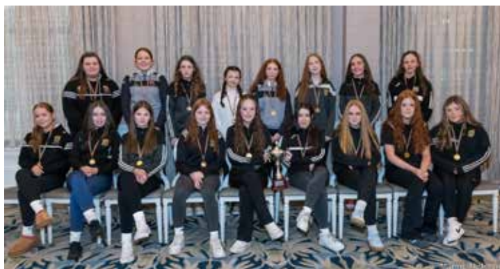
U16 Girls County League Cup Winners