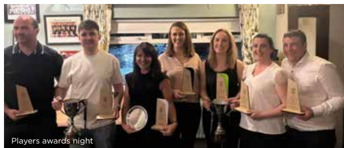
Players awards night

With more players than ever and a growing reputation on the national stage, the future for rounders in West Mayo is bright. Here's to another exciting year ahead for Kilmeena GAA Rounders.