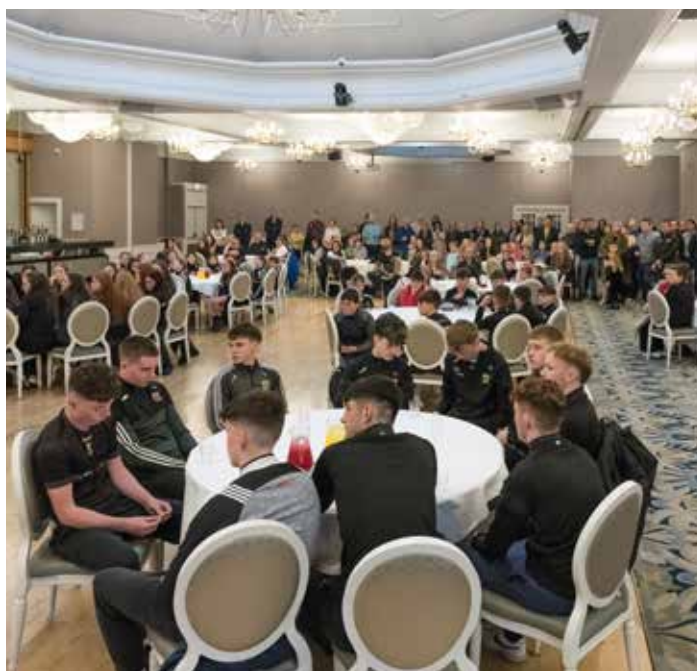
A view of the huge attendance in the Dome Suite, Castlecourt Hotel