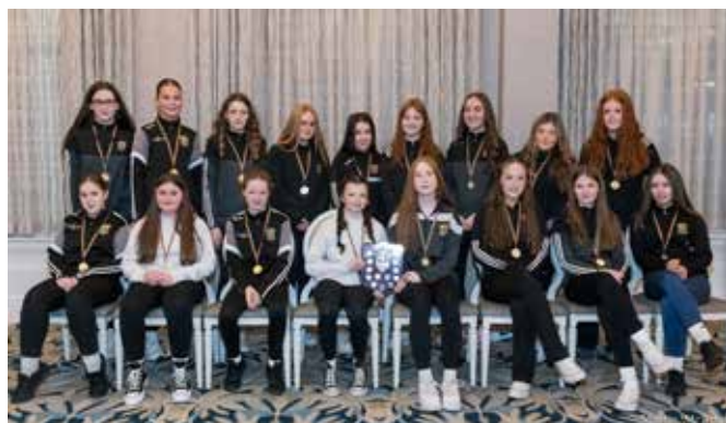
U14 Girls County League Shield Winners